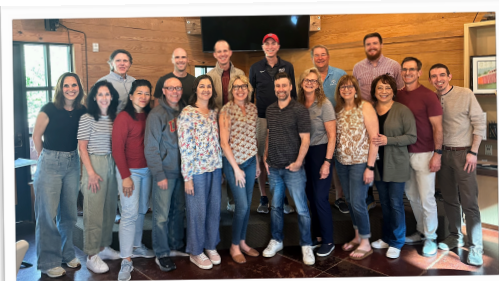
The Cru Embark (Young Adults) staff at our conference in Houston.

During our conference, some leaders from Alpha Ministries were there to share some of the latest data and research on the state of Young Adults globally. Though the information was not surprising, it provided another reminder of why our work with Young Adults is so important.